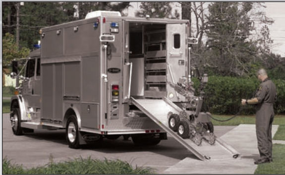
Robot ramps at rear or sides of body with integral ramp storage.