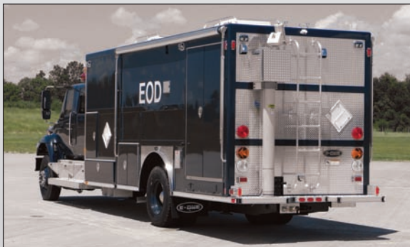
Body lengths of 16', 19' and 20'.